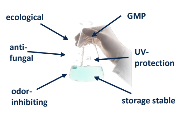
Beneficial properties of phytoextract from cell cultures of sage plant

Plants exhibit natural protective mechanisms against external influences such as fungal or bacterial attack. This is attributable to substances produced in the plant cells. To make this active substances usable for humans, it is necessary to extract the substances from the cells. The phytoextract obtained in this way shows many positive properties and a wide range of applications. The plant cells can be obtained by cultivation in a bioreactor as an alternative to agricultural cultivation. Cultivation under controlled conditions enables targeted production, which is associated with a considerable increase in yield compared to land cultivation.